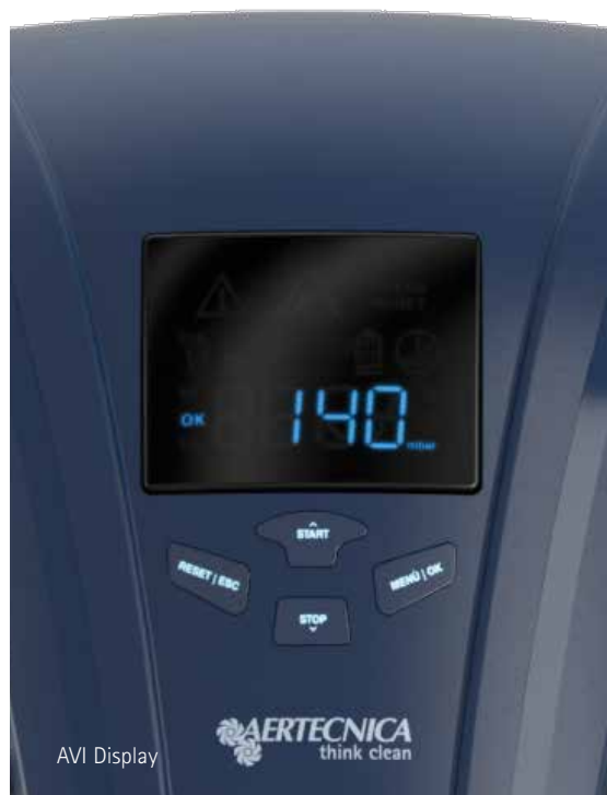
The Dynamic Control Display automatically configures itself to the type of central vacuum unit it is connected to.